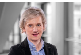
CDU City councillor