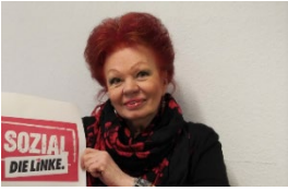
Parliamentary group Die FrAKTION City councillor