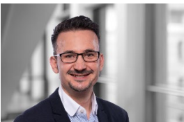
SPD City councillor