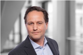
AfD City councillor